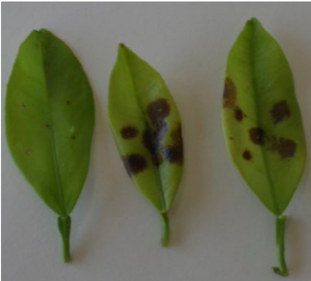
Figure 3. Necrotic lesions caused by Colletotrichum gloeosporioides on artificially inoculated orange leaves (injured/drop method) after 48 hours of incubation. Control leaf on the left.

infectious agent in this crop. Our experiments show that the parasite requires wounds to penetrate the leaves, hence we consider that injuries caused by biotic and abiotic factors allow development of citrus anthracnose.