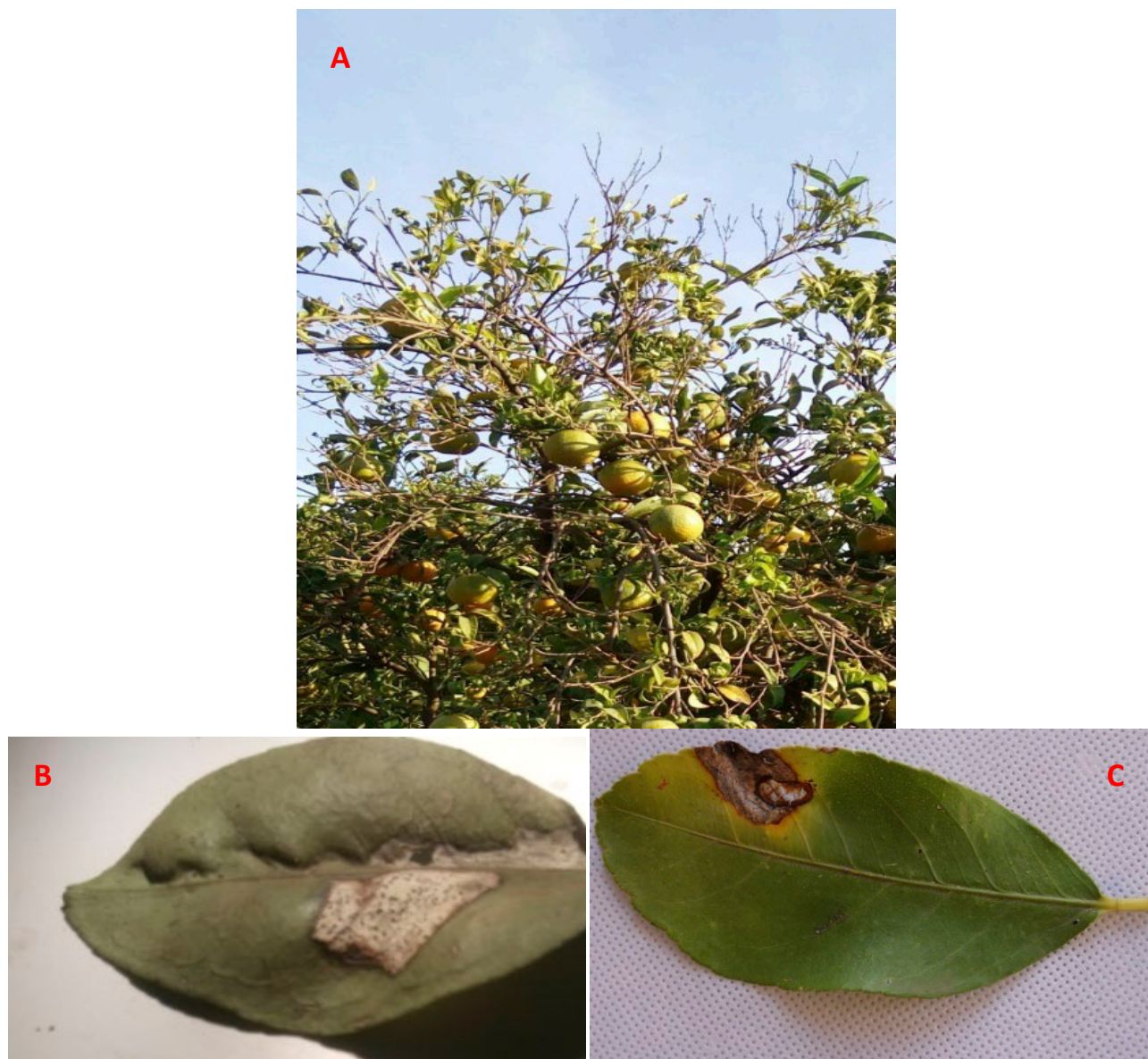
Figure 1. Anthracnose symptoms observed on sweet orange cv. Thomson Navel (A); leaf lesions associated with black fructifications (acervuli) on orange leaf (B) and on lemon leaf (C).

Fungal cultures were obtained from diseased leaves and twigs and purified as single spore isolates. After 7–10 days of growth on PDA medium, colonies exhibited a fluffy mycelium, initially white gray, with abundant bright orange conidiomata (acervuli) (Figure 2a, d). Mean radial growth rate was 11.3 mm per day at 25°C in the dark, during 7 days of culture.