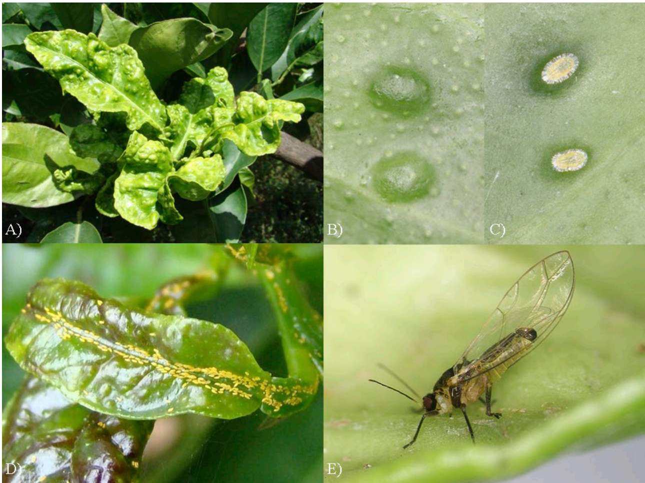
Figure 2. A, bumps on the upper leaf surface caused by Trioza erytreae ; B, detail of these bumps; C, T. erytreae nymphs located on the underside of the leaf; D, eggs laid on the leaves; E, male of T. erytreae .

low shoots, typical blotchy mottled leaves or fruit colour inversion were never observed in the surveyed trees.