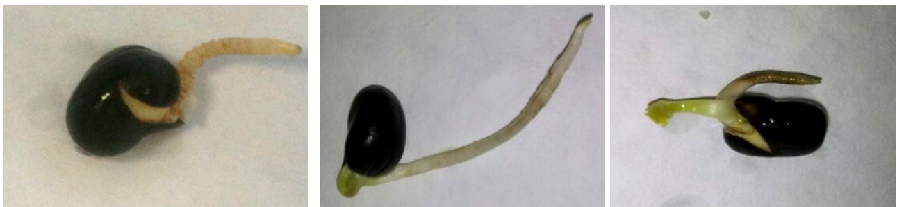
Figure 2. In vivo tests on Vicia faba roots treated with essential oil. Meristems showed a callose production after the treatment as an early symptom caused by lipid peroxidation.