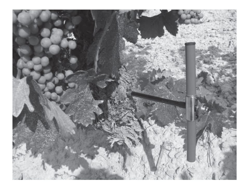
Fig. 1. Sampling of grapevine wood by means of an increment borer.

Eutypa lata and D. seriata were frequently isolated, in 23 and 56 dishes out of 116 respectively. Many saprophytic fungi were also isolated (for exam-