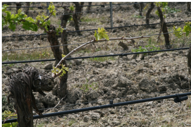
Fig. 1. Retarded growth and spur dieback in 13-year-old vines cv. Insolia infected with Lasiodiplodia theobromae .

the severity of the disease increased greatly: the infected vines showed progressive spur, cane and arm dieback, with depressed bark and cracks and re-vegetation at the base, while 20 plants died. At the same time the number of symptomatic vines increased, so that by the end of the season a total of 12.4% of the 500 vines surveyed had died or were showing decline symptoms. In the survey carried out in August 2007, 43% of the declining vines also showed a paler colour along the margins and in the interveinal area of the leaves (Fig. 3).