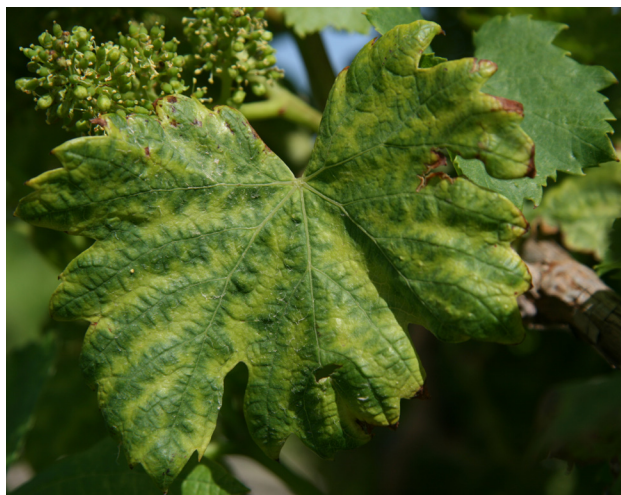
Fig. 3. Mild chlorosis in the marginal and interveinal leaves of cv. Insolia. All vines showing foliar chlorosis sampled were infected with L. theobromae .