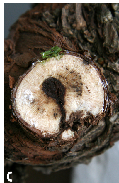
Fig. 2. Brown necrosis caused by L. theobromae extending along a large part of the trunk: A, cross section; B, longitudinal section; C, black spots.