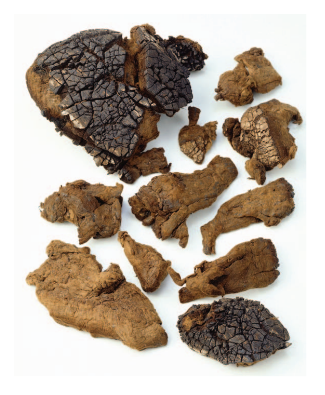
Fig. 1. Fragments of tinder carried by the Ice man. Photo Augustin Ochsenreiter, Fotoarchivio Museo Archeologico dell'Alto Adige, Bolzano, Italy (www.iceman.it).