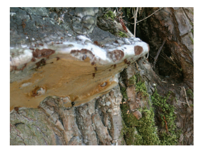
Fig. 3. Carpophore of the false esca fungus, Phellinus igniarius on a willow tree.