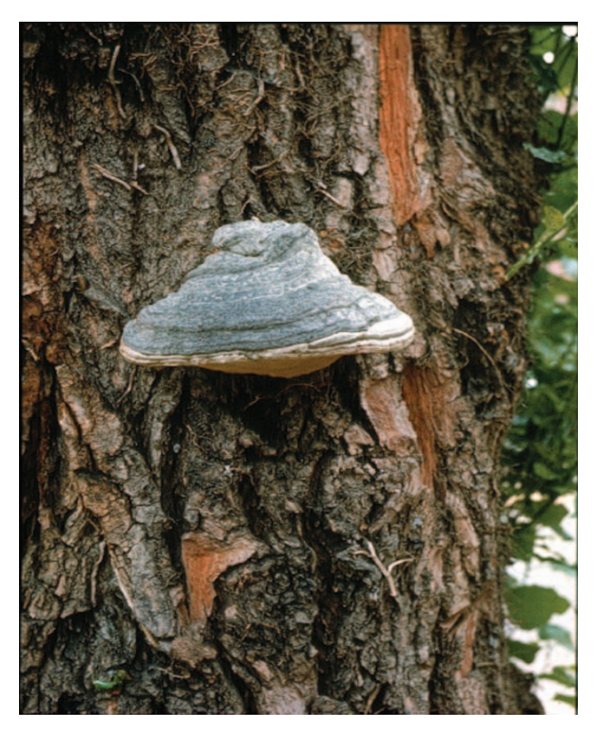
Fig. 2. Carpophore of the true esca fungus, Fomes fo mentarius on a beech tree.

found in mediaeval works, e.g. the writings of Ibn al-Awam and Piero de' Crescenzi (13th century). In more recent times, esca was associated with wood-decay (white rot) and was considered to be a disease affecting old vines.