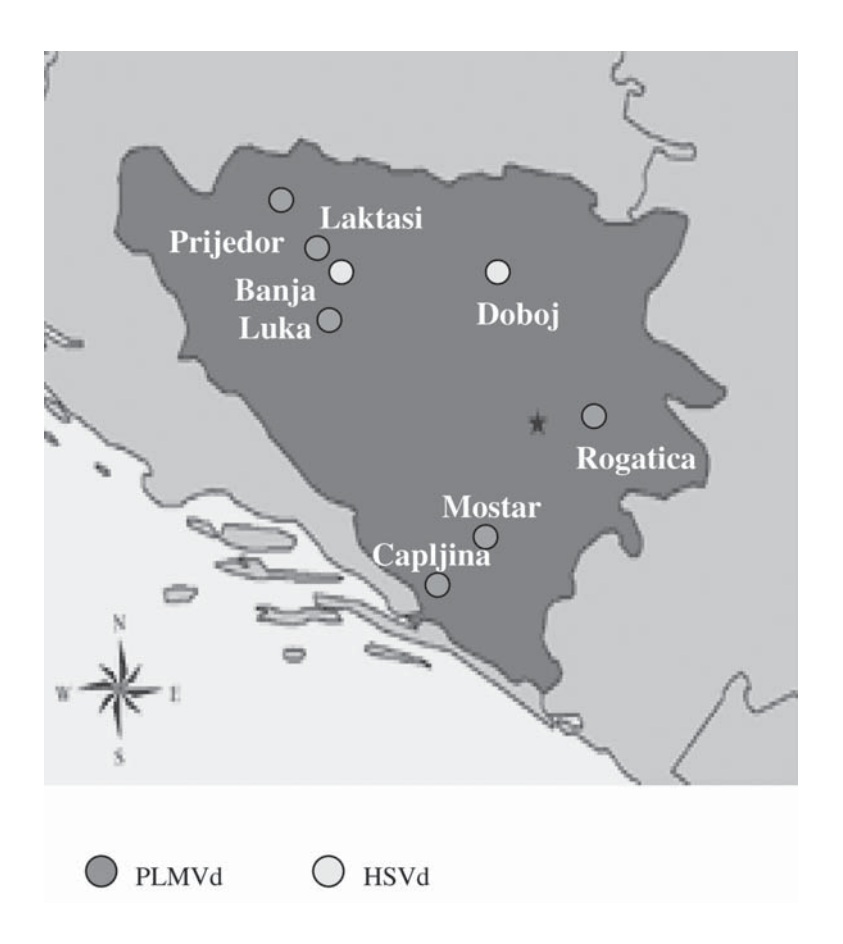
Fig. 2. Distribution (in circles) of PLMVd (solid) and HSVd (open) in Bosnia and Herzegovina.

zares et al. , 1998), Syria (Ismaeil et al. , 2001), Western Turkey and Egypt (Torres et al. , 2004).