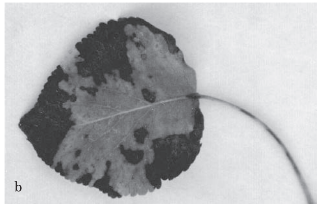
Fig. 3 (a, b). Symptoms in leaves of Pyrus mamorensis artificially inoculated by conidial suspension of Pestalotia subcuticularis .