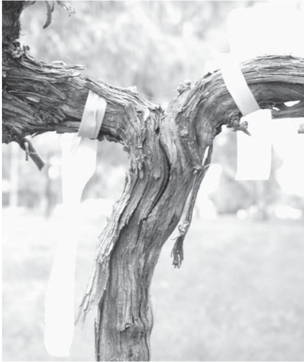
Fig. 2. Cracks in upper trunk at crown of vines in which P. chlamydospora was found sporulating.