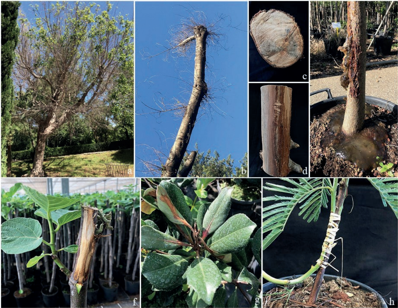
Figure 4. Disease symptoms caused by Botryosphaeriaceae on ornamental plants in urban environments and nurseries: (a and b) diseased plant of Ficus microcarpa with defoliation and shoot dieback all over the canopy; (c and d) bark discolored and cracked along the branch and internal tissues showing blackish V-shape lesion of F. microcarpa ; (e) canker and gummosis of Brachychiton sp.; (f) internal discoloration of Ficus carica cutting; (g) necrosis at the bottom of the leaves of Raphiolepis indica , moving from petioles upward through the mid rib and blade; (h) canker at the graft union on young Acacia dealbata plant grafted on A. retinodes .

Osteen, and Kensington Pride) in north-eastern Sicily (Figure 5, a to e). Morphological and molecular characters and pathogenicity tests identified the associated pathogens, including B. dothidea , L. theobromae and N. parvum (Aiello et al. , 2022). Among these, N. parvum was widespread on tropical crops in the area (Guarnaccia et al. , 2016; Aiello et al. , 2022), and on citrus (Bezerra et al. , 2021). This species was also detected causing seedling blight of mango ( Mangifera indica ) in a nursery (Polizzi et al. , 2023). Mango fruit symptoms were not reported in Italy, but different authors showed the severe rot symptoms caused by Botryosphaeriaceae on the stem ends of fruit when infections commenced from pedicles or from fruit surfaces (Figure 7, d to f) (Ni et al. , 2010).