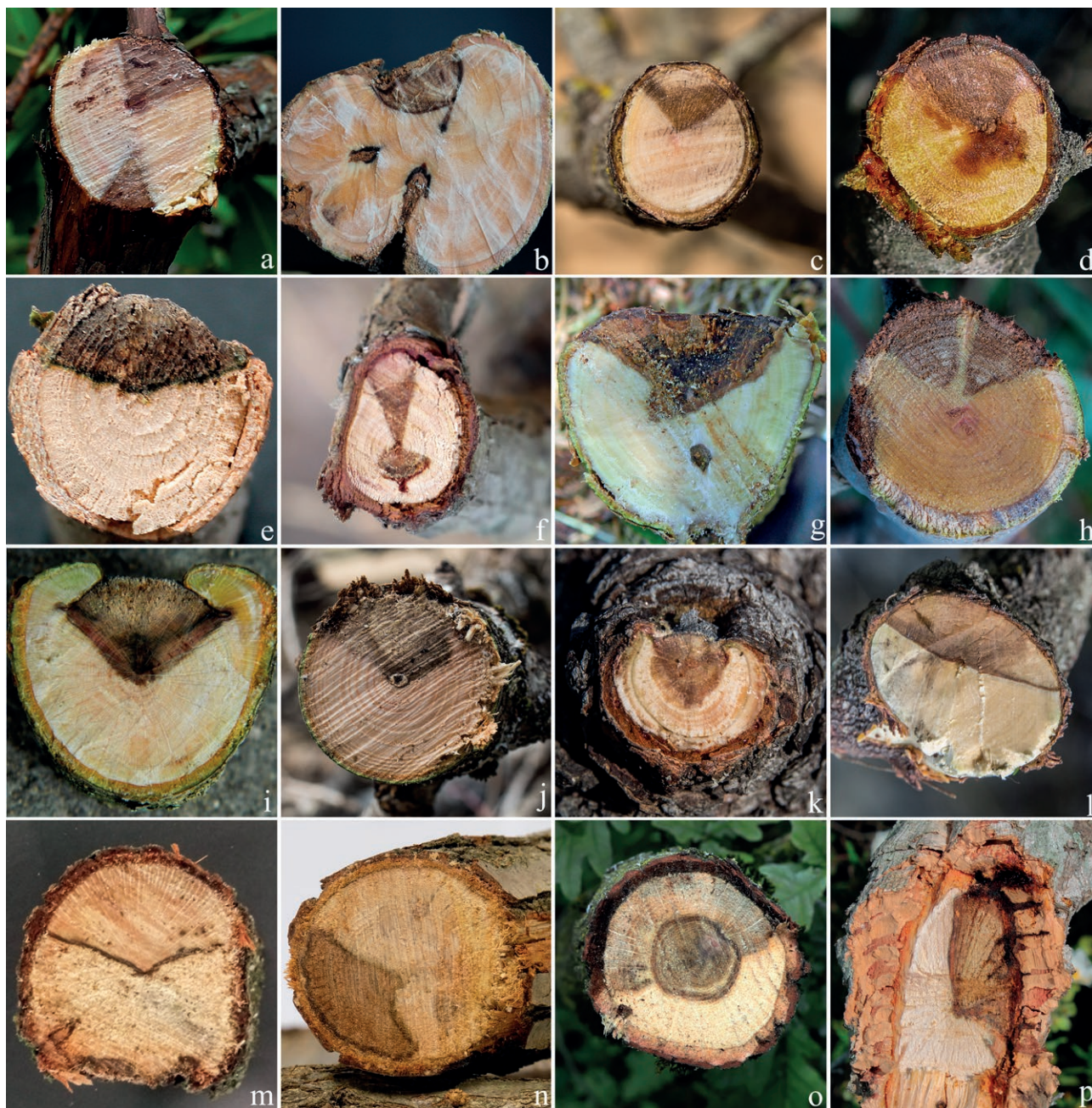
Figure 3. Overview of internal disease symptoms caused by Botryosphaeriaceae on different forest trees and shrubs: (a) cross section of branches showing the characteristic wedge-shaped necrotic sector caused by Neofusicoccum mediterraneum on Arbutus unedo ; (b) Neofusicoccum parvum on Olea oleaster ; (c) Diplodia insularis on Pistacia lentiscus ; (d) Dothiorella sp. on Rhamnus alaternus ; (e) Sardiniella urbana on Celtis australis ; (f) Diplodia cupressi on Cupressus sempervirens ; (g) Diplodia seriata on Corylus avellana ; (h) Neofusicoccum australe on Eucalyptus camaldulensis ; (i) Neofusicoccum parvum on Fagus sylvatica ; (j) Diplodia fraxini on Fraxinus excelsior ; (k) Diplodia sapinea on Pinus mugo ; (l) Botryosphaeria dothidea on Rhododendron ferrugineum ; (m) Diplodia corticola on Quercus ilex , (n) Q. pubescens , (o) Q. robur and (p) Q. suber .

leading to substantial yield losses and decreases in market value. After the first report of dieback caused by N. parvum on mango (Ismail et al. , 2013), surveys carried