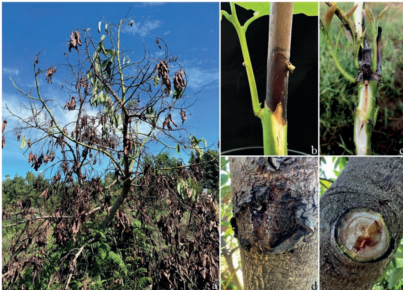
Figure 6. Disease symptoms caused by Botryosphaeriaceae on field-grown avocado plants: (a) severe shoot dieback in the canopy; (b) branch dieback; (c) infection starting from pruned wound; (d and e) external canker and discoloured internal tissues.

traditionally linked to the territory of Bronte (Catania province) where natural plantings of pistachio are present. These orchards are defined as “natural pistachio plantings” obtained by grafting in situ spontaneous terebinth plants ( Pistacia terebinthus ) that grow widespread in the volcanic mountain soils of the area (Barone et al. , 1985). More recent pistachio orchards in Agrigento and Caltanissetta provinces, named “new” orchards characterized by rational design, scheduled irrigation and fertilization, and mechanical harvest, are increasing in the territory (Marino and Marra, 2019).