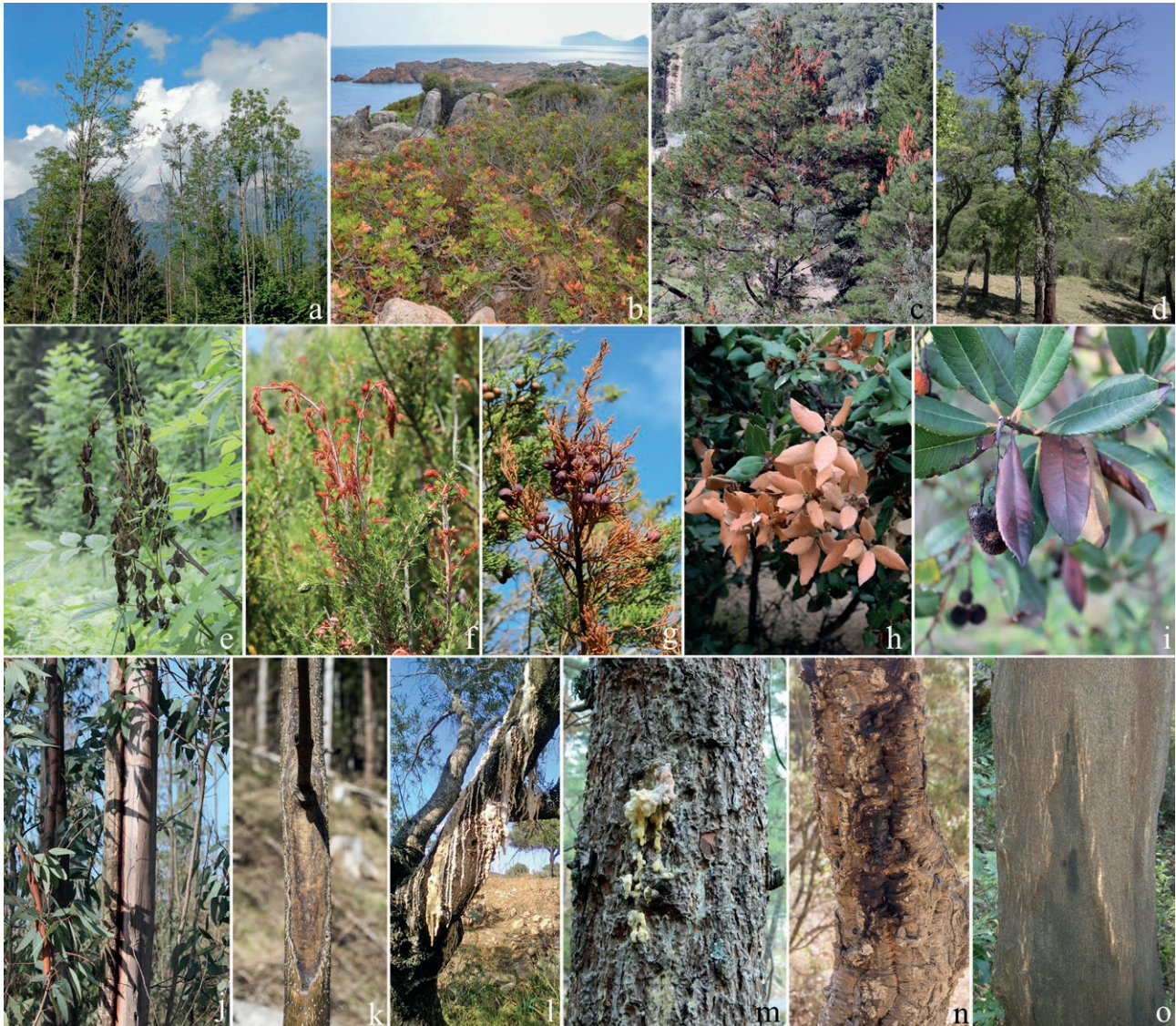
Figure 2. Overview of external disease symptoms caused by Botryosphaeriaceae on different forest trees and shrubs. (a) progressive canopy dieback caused by Diplodia fraxini on Fraxinus excelsior ; (b) Diplodia insularis on Pistacia lentiscus ; (c) Diplodia sapinea on Pinus radiata ; (d) Diplodia corticola on Quercus suber ; (e) shoot blight caused by D. fraxini on F. excelsior ; (f) Neofusicoccum luteum on Erica arborea ; (g) Diplodia africana on Juniperus phoenicea ; (h) D. corticola on Quercus ilex ; (i) Neofusicoccum mediterraneum on Arbutus unedo ; (j) sunken canker with exudations caused by Neofusicoccum australe on Eucalyptus camaldulensis ; (k) D. fraxini on F. excelsior ; (l) Neofusicoccum parvum on Olea oleaster ; (m) D. sapinea on Pinus radiata ; (n and o) D. corticola on Q. suber .

Branch cankers and dieback caused by N. parvum and Neoscytalidium dimidiatum were also observed on Meryta denhamii in a historical botanical garden (Gusella et al., 2023b).