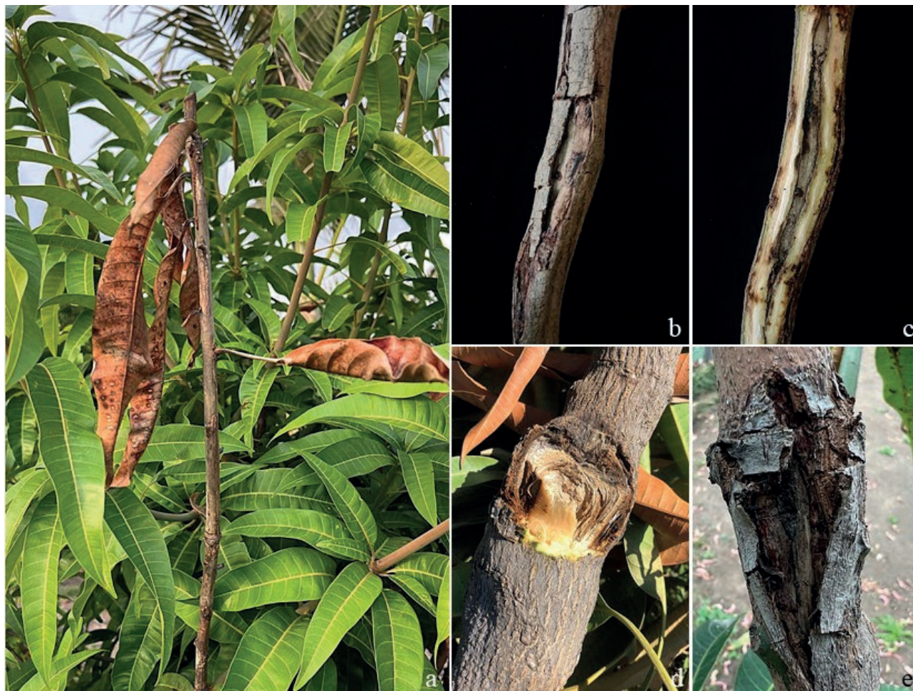
Figure 5. Disease symptoms caused by Botryosphaeriaceae on field-grown mango plants: (a) shoot dieback; (b and c) external and internal canker; (d) internal necrotic tissue; (e) external canker and bark cracking.

of Botryosphaeriaceae . Phylogenetic analyses identified five Botryosphaeriaceae species: B. dothidea , L. citricola , M. phaseolina , N. crypto australe and N. luteum . The symptoms included cankers on shoots and branches, and trunk and shoot dieback. Cankers were usually associated with reddish sap that became white/beige with age. Bark was cracked, darkly discoloured and sometimes slightly sunken. Occasionally, white sugar-like powder was present on the bark surface. Under the bark, canker wood tissues were reddish or light brown to black, and variable in shape. Characteristic wedge-shaped discoloration affecting the xylem was visible in cross sections. Under high disease pressure, wilting of shoots and leaves was also observed (Fiorenza et al. , 2023).