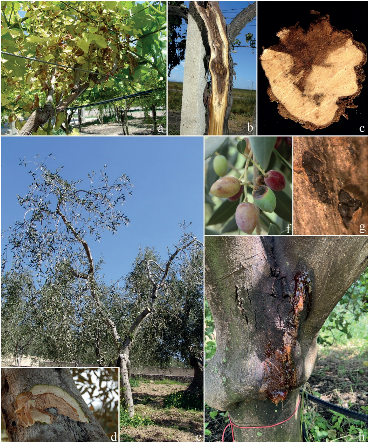
Figure 8. Disease symptoms caused by Botryosphaeriaceae on grapevine, olive and citrus in field-grown plants: (a) dieback in the host canopy; (b and c) canker and discoloured internal tissues occurred on grapevine stem; (d and e) canker and subcortical discoloured tissues on olive branches; (f) olive rotted drupes, and (g) emerging perithecia by bark from an affected olive trunk; (h) trunk canker, bark cracking and gummosis on lemon.