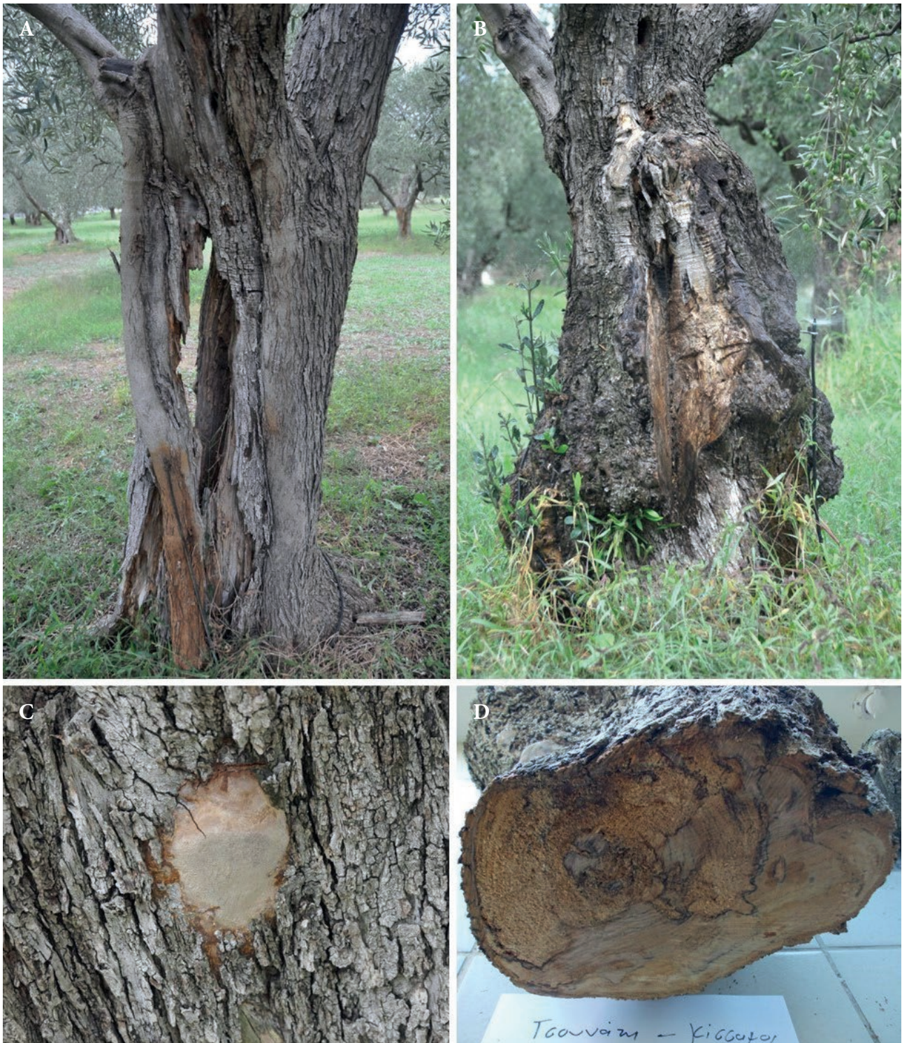
Figure 2. Wood decay (Esca) symptoms in olive trees in Thrace, Northeastern Greece, infected by Fomitiporia mediterranea . Canker in the trunk (A); white rot appeared after removing a trunk sector due to incorrectly adjusted irrigation sprinklers which created conducive conditions for fungal infection (B); carpophore of F. mediterranea formed on the trunk surface (C); trunk cross section revealing light-coloured wood rot surrounded by a brown necrotic zone (D).