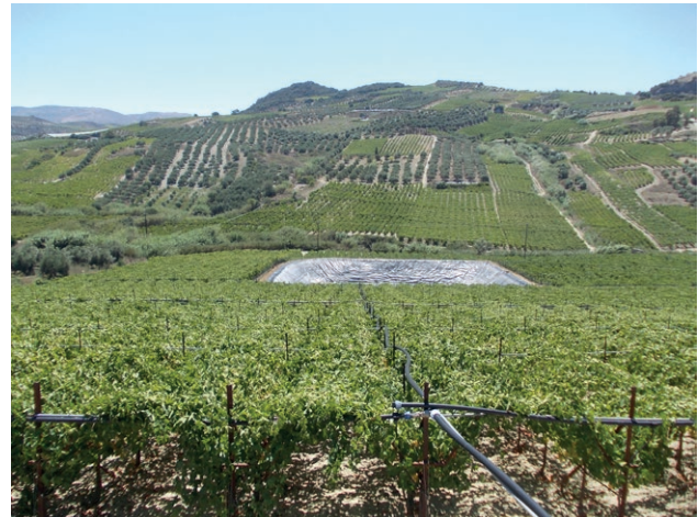
Figure 3. Typical landscape of adjacent vineyards and olive orchards in Crete, Southern Greece, which allows the inoculum flowing.

Plant propagation in fruit crop and grapevine nurseries includes complex systems in which pathogen management is challenging. Infected nursery stock can be important long-distance vectors for FTD pathogens (Gramaje and Armengol, 2011). Studies in Europe on death of young or newly established fruit crop trees have shown that latent infections occurring during nursery propagation are important for development of cankers observed in the orchards (Brown et al. , 1994; Smit et al. , 1996; Marek et al. , 2013). Certified nursery trees are not commonly surveyed for latent fungal infections, which can lead to severe symptoms in newly established stone fruit orchards (Mostert et al. , 2016; van der Merwe et al. , 2021). McCracken et al. (2003) found that cankers caused by N. ditissima on scion shoots of 1-year-old commercial apple trees, developed after infections that occurred during the final stages of propagation. Marek et al. (2013) found that latent infections, occurring in nurseries, caused wood cankers during cold stor-