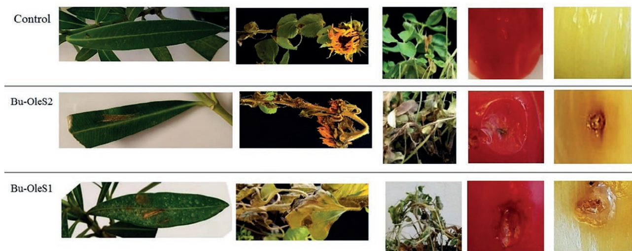
Figure 3. Results from pathogenicity tests for different plants, from inoculation controls (upper row), or plants inoculated with two Serratia marcescens isolates (Bu-OleS2 or Bu-OleS1). The first column shows oleander leaves on the day of inoculation, the second and third columns show sunflower and alfalfa plants, the fourth and fifth columns show bell pepper fruit and onion bulbs at 5 to 6 d post-inoculation.

(MK461848) and most similar to isolates from sunflowers (KT741017, KT741016, KT741020, KT741019, KT741018) (Figure 4).