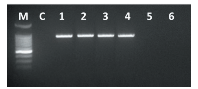
Figure 2. RT-PCR detection of Parietaria mottle virus in symptomatic Phytolacca americana L. leaves. Lanes M, 100 bp DNA ladder; C, control without total RNAs; 1, Positive control (PMoV infected tomato plants); 2 to 4, symptomatic P. americana leaves from three different plants; 5 and 6, asymptomatic P. americana leaves from two different plants.

The ACP-ELISA results were confirmed with reverse transcription (RT)-PCR. The expected 916 bp fragment was obtained from symptomatic pokeweed (Figure 2) and tomato plants tested, while no amplicon was