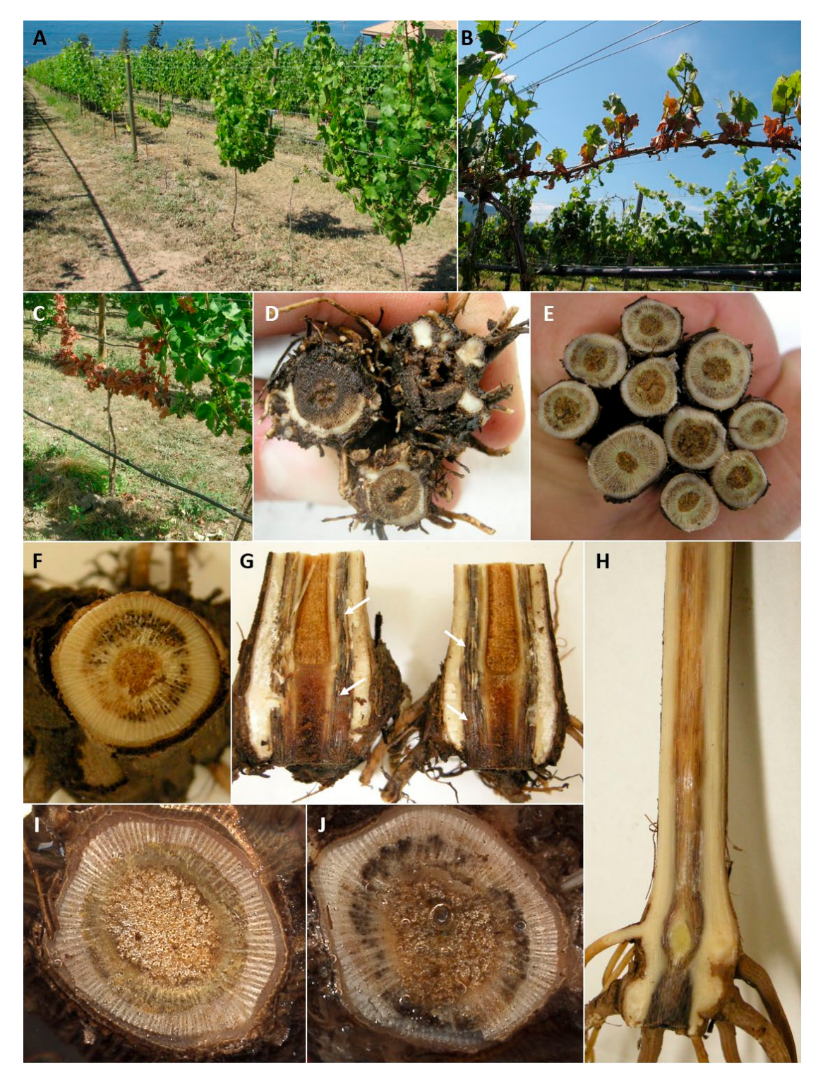
Figure 3. Decline of young vines caused by Petri disease and/or black foot. Overall symptoms in the field include poor vigour, leaf chlorosis, short internodes ( A and B ) and eventual or sudden collapse ( C ) during the growing season. Internal wood necrosis observed at the basal end of the rootstock ( D ) commonly associated with black foot. Tylosis plugged xylem vessels and necrosis observed at a graft union ( E ) and trunk base, usually associated with Petri disease in young vines ( F ). Longitudinal section of a ready-to-plant nursery vine showing vascular necrosis originating from the basal end of the rootstock ( G and H ). Phaeomoniella chlamydospora, Phaeoacremonium spp., Ilyonectria spp., and some Botryosphaeriaceae spp. can be isolated from asymptomatic ( I ) and symptomatic ( J ) wood tissues from nursery propagated material, which reveals their potential latent phases in grapevines.