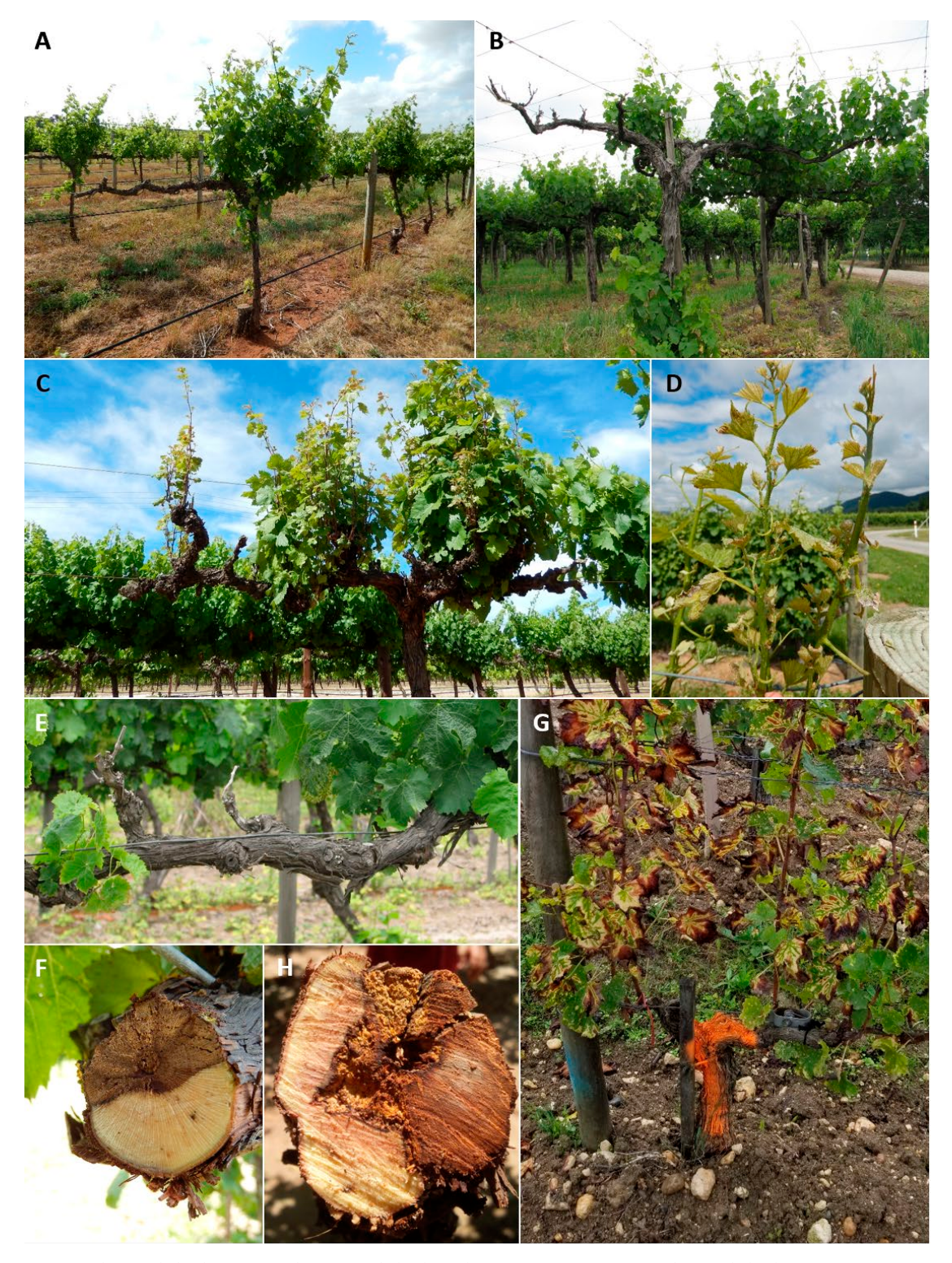
Figure 2. Botryosphaeria dieback, Eutypa, Phomopsis dieback, and Esca symptoms. Botryosphaeria dieback symptoms on wine (A) and table grapevines (B) are characterized by dead spurs and cordons with no spring growth. Characteristic foliar symptoms of Eutypa dieback are shoots with short internodes and chlorotic and cupped leaves (C and D). Phomopsis dieback symptoms resemble those of Botryosphaeria dieback, with dead spurs and lack of spring growth (E). Vines affected by Botryosphaeria, Eutypa and/or Phomopsis dieback have perennial cankers in spurs, cordons and trunks, often with wedge shapes (F). Tiger-striped leaves (G) and characteristic soft yellowish wood rot (H) caused by Basidiomycete fungi are commonly associated with Esca disease.