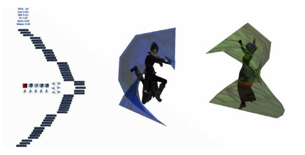
Figure 7. Poster for Heart of Tones, with HuD on the left and Bingo Onomatopoeia and Fernsing Lewellyn .

1999 at Mills College, were the premiere of the piece was done.