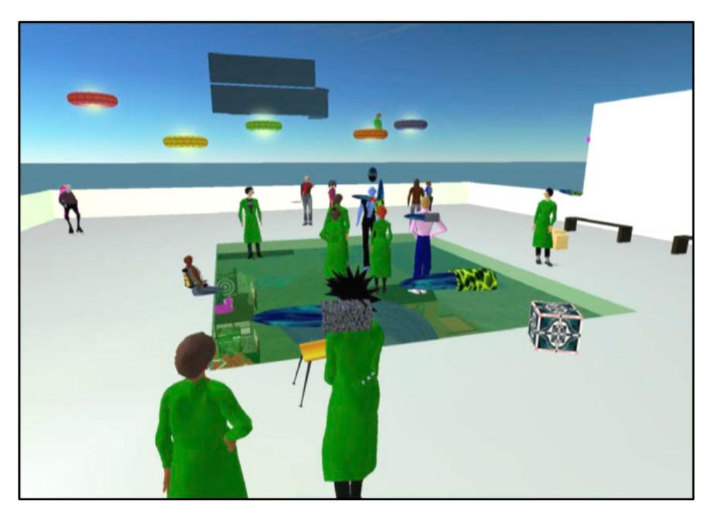
Figure 4. First performance of the AOM, performing the piece Vickys Mosquitos (VM#13) in the festival.

(#12) in a real world situation in an old oil cistern with 25 sec reverbation time, so I was interested in following this approach in a virtual SL environment. I think there are