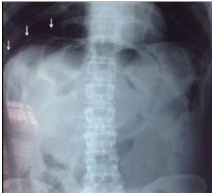
Figure 1 – Plain abdominal radiograph demonstrating vertically oriented radio-opaque shadows (arrows) within the right hemi-diaphragm. These areas corresponded to the projections observed at laparoscopic surgery.

The projections were oriented vertically, emanating radially from the central tendon to the costal margin. This is clearly demonstrated in the plain radiographs and the intra-operative pictures presented (Figures 1 and 2). We believe that this finding challenges the theory that HSGs are due to external compression by ribs (Newell and Morgan-Jones, 1993; Muktyaz et al., 2013; Ono et al., 2000) because the ribs are in a transverse orientation over the hepatic surface area.