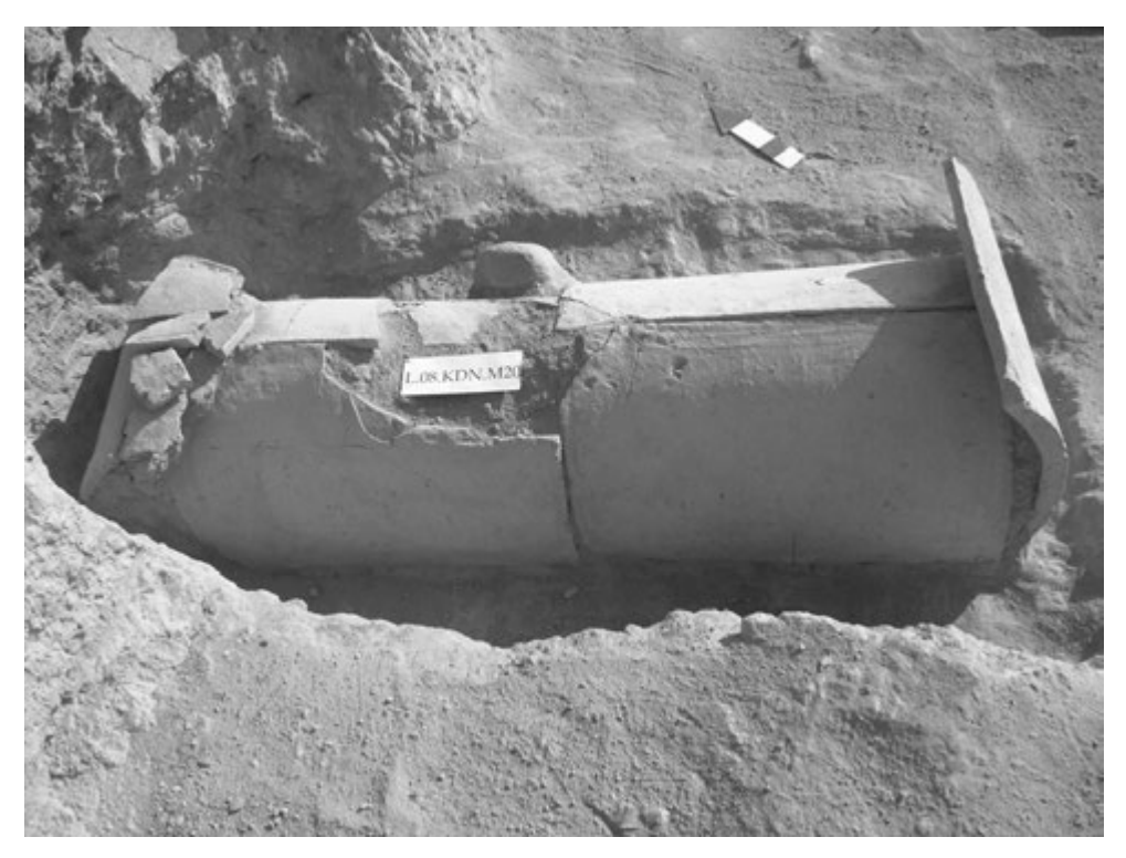
Figure 1 – The tomb of the reported skeleton.

above the skeleton which was placed supine (Figure 1, 2). On the basis of stratigraphic level and similar examples, the tomb was dated to the beginning of the 1st century AD (Simsek, 2007, 2011). The bone surfaces were smooth with no evidence of fracture or degenerative changes. During the examination of the cranial bones, we detected bilaterally abnormally long styloid processed. The length was 3.3 cm and 5.1 cm on the right and left side, respectively. The circumference of the process at the most thick and thin parts, respectively, was 1.9 cm and 0.4 cm on the right side and, 1.7 cm and 0.5 cm on the left side (Figure 3). No variation was observed in the other bones, including atlas and axis.