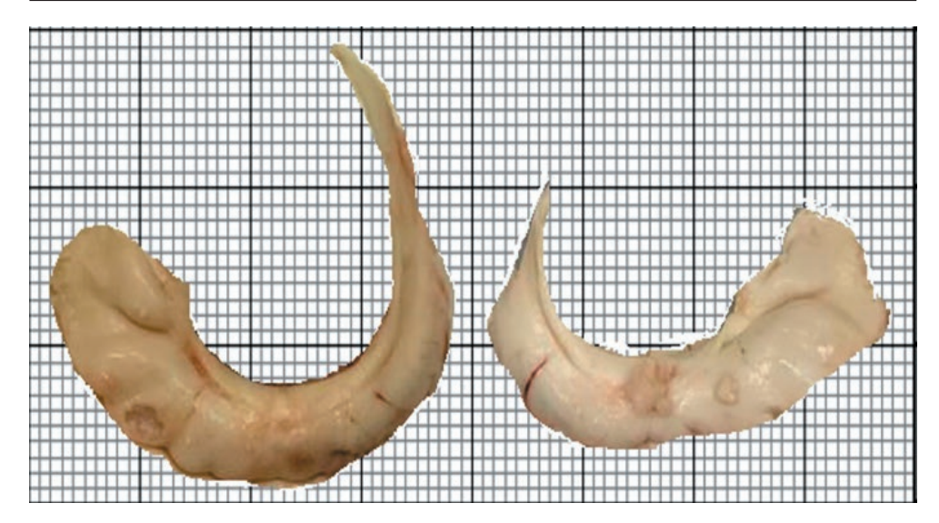
Figure 2. Picture of hippocampi over the millimeter grid background.