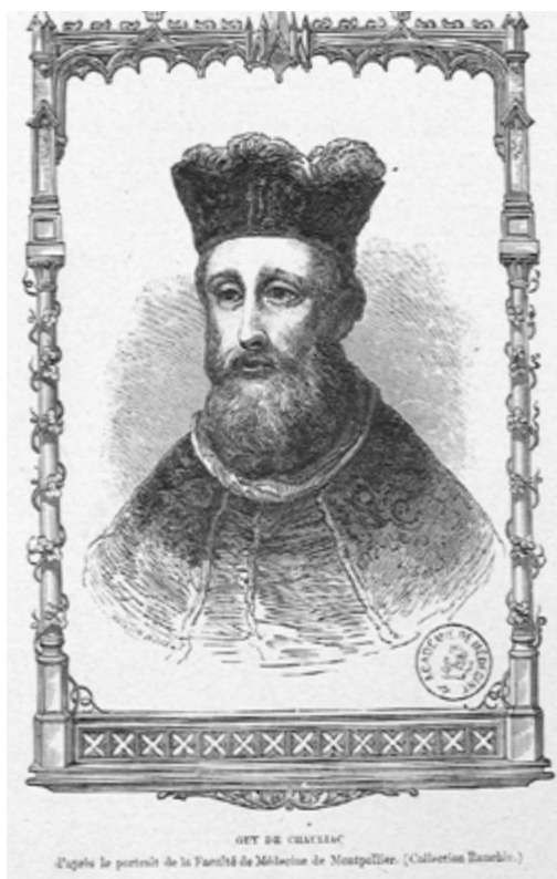
Figure 2 – Guy De Chauliac. BIU Santé, Paris, Collection de portraits.

Falcon’s treatise on Chauliac remained as one of the greatest text on surgery and anatomy for the centuries to come. This book was apparently intended for the use of barber-surgeons in order to educate them and put them in a more scientific path. A plethora of subjects were included, as views on fractures, various kinds of hernia, varicocele, hydrocele and sarcocele, surgical equipment and the dentistry of the period, themes enriched with Falcon’s illustrations (Dulieu, 1979). Some aspects of the text, as Chauliac’s belief that the wounds of the uterus had to be considered mortal, became subjects for scientific debates. Thus Avenzoar took the opposite view, while Avicenna asserted that the entire uterus could be removed safely (Ricci, 1990).