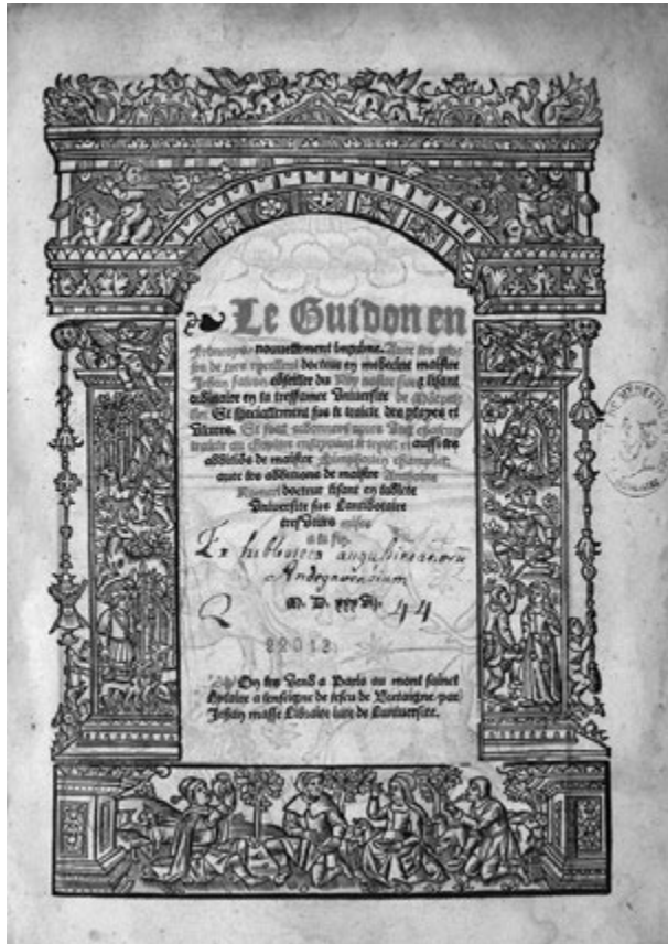
Figure 3 – The “Guidon”.

Falcon not only gave the first example on commenting works of great surgeons, soon to be followed by others, but also wrote and illustrated an extraordinary manuscript, the “Guidon”, which knew several editions. The first edition was released in Lyon in 1515, with 230 pages, and the last one, again in Lyon, in 1649, with 1000 pages (Dulieu, 1979).