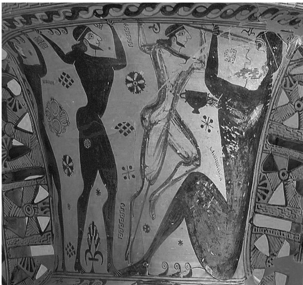
Figure 2 – The blinding of the Cyclops Polyphemus by Ulysses. Funerary Proto-Attic Amphora (670-660 BC). Archaeological Museum of Eleusis.

Cyclops, though he is naive, is aware of the Trojan War and becomes sarcastic at Ulysses when discussing the war with him. Euripides, more precisely than Homer, believes that the island where Cyclops was found by Ulysses was Sicily and mentions that the cave where he lived was in the famous volcano of Etna. In general, the Greek tragedian does not alter the plot of the myth, but the cause for Polyphemus's blinding. The moral of his satirical drama is the triumph of human intelligence, as represented by Ulysses, over savagery and illiteracy.