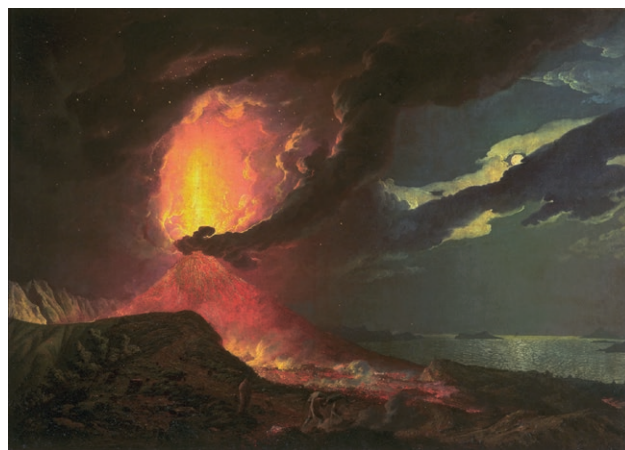
Fig. 2. Joseph Wright of Derby 1734–1797, Vesuvius in Eruption, with a View over the Islands in the Bay of Naples c.1776–80, Oil paint on canvas, support: 1220 × 1764 mm; frame: 1461 × 1941 × 95 mm, Tate Gallery, https://www.tate.org.uk/art/artworks/wright-vesuvius-in-eruption-with-a-view-over-the-islands-in-the-bay-of-naples-t05846 .