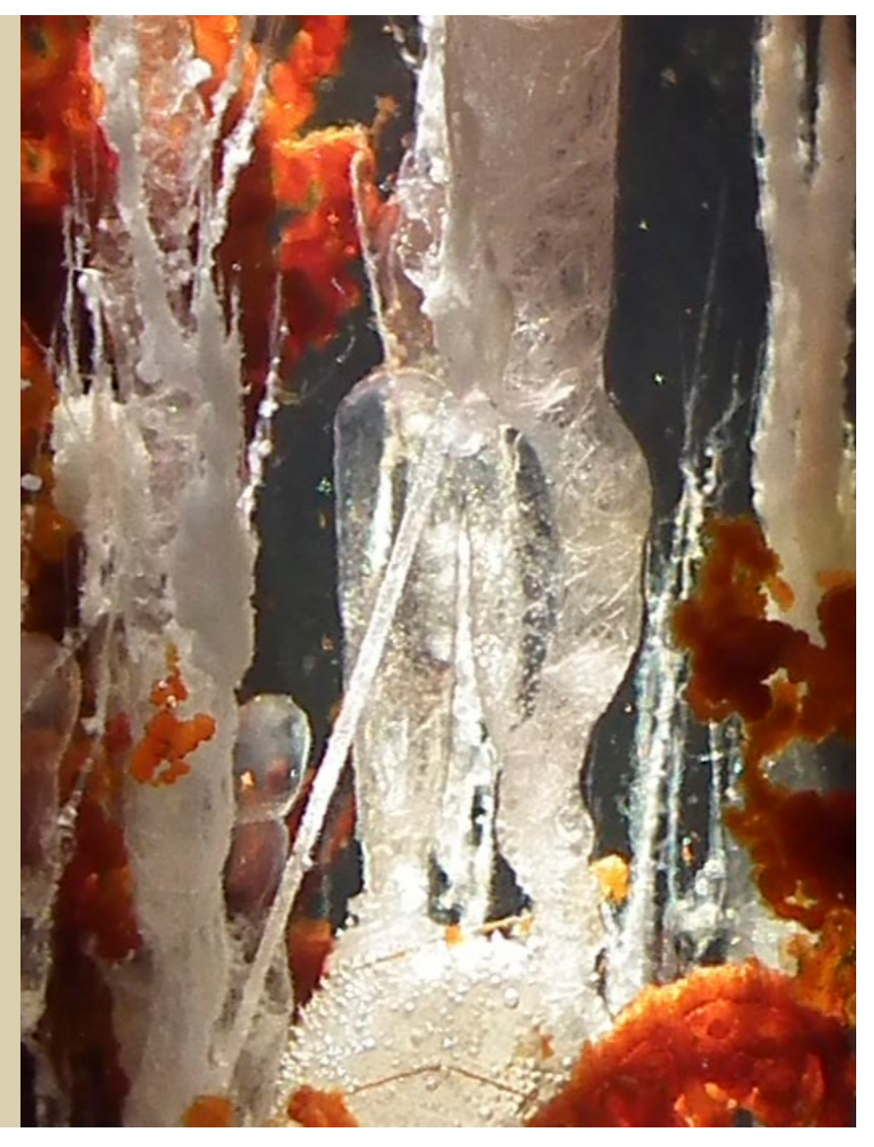
Fig. 1. Chemical gardens grown from silicates. Chemical gardens are steady-state structures formed by insoluble metal compounds (mostly silicates) in water, which form semipermeable membranes capable of growing into plant-like shapes as a result of ionic osmotic pressure. Chemical gardens are useful for studying the abiotic formation of structures similar to living ones.