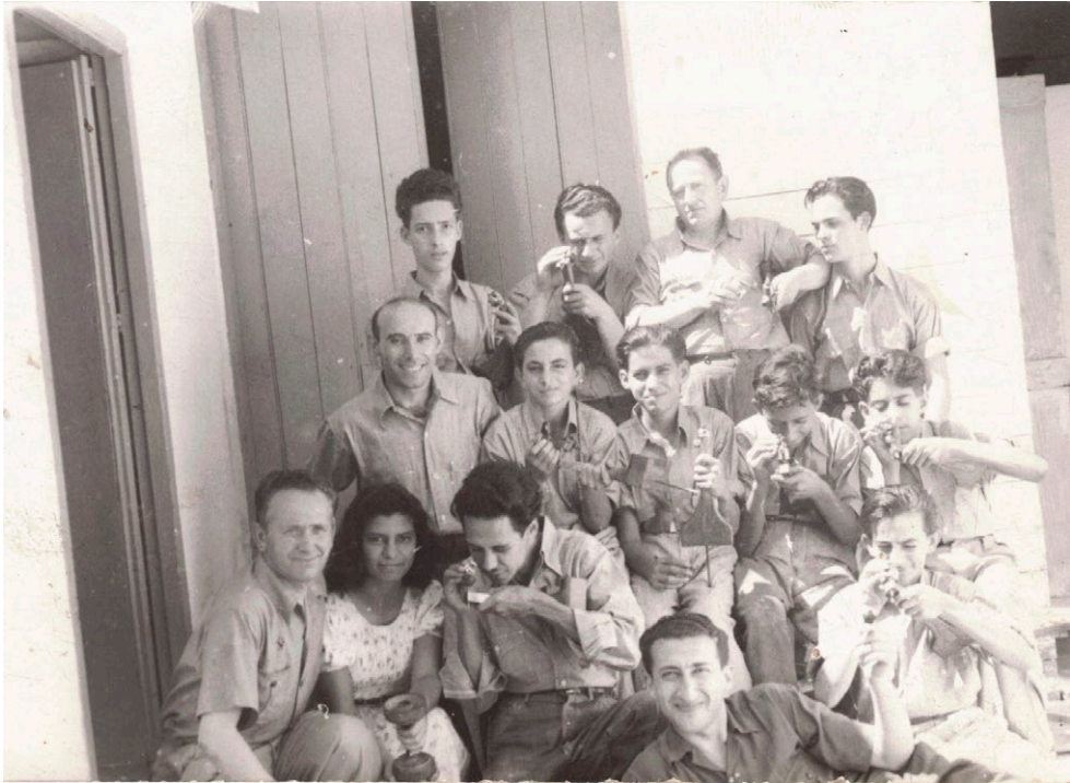
Figure 4. Diamond Workers, (Photo courtesy of Sandy Ray with permission).

which was then also utilized in the cutting process. Occasionally, an errant stone was also found in the sweeping. Often young Cuban boys, who worked on tips, would sweep the floors in search of stray diamonds that had been dropped during the work day.