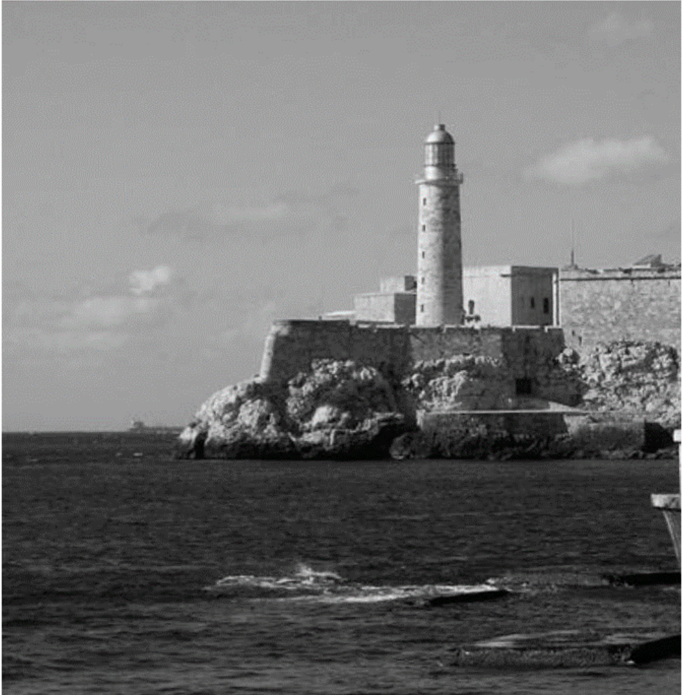
Figure 1. Morro Castle