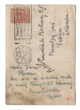
Fig. 2 – Eva to Constance – a postcard from Rome, 1920