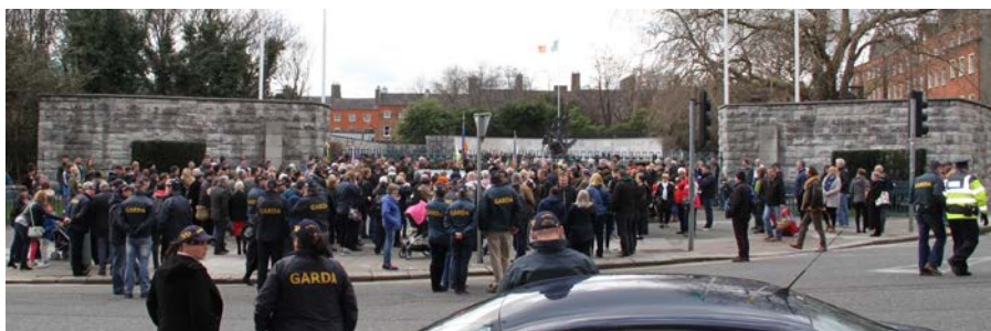
3 - Police officers (with “Garda” on the back of their jackets) observing the crowd outside of the Garden of Remembrance (28 March 2016)

Before the march, there was a heavy police presence in front of the Garden of Remembrance. Image 3 shows groups of officers from the counterterrorism Special Detective Unit (“Special Branch”), wearing distinctive dark blue jackets and hats, standing in the street and watching potential marchers, interested passersby, and journalists.