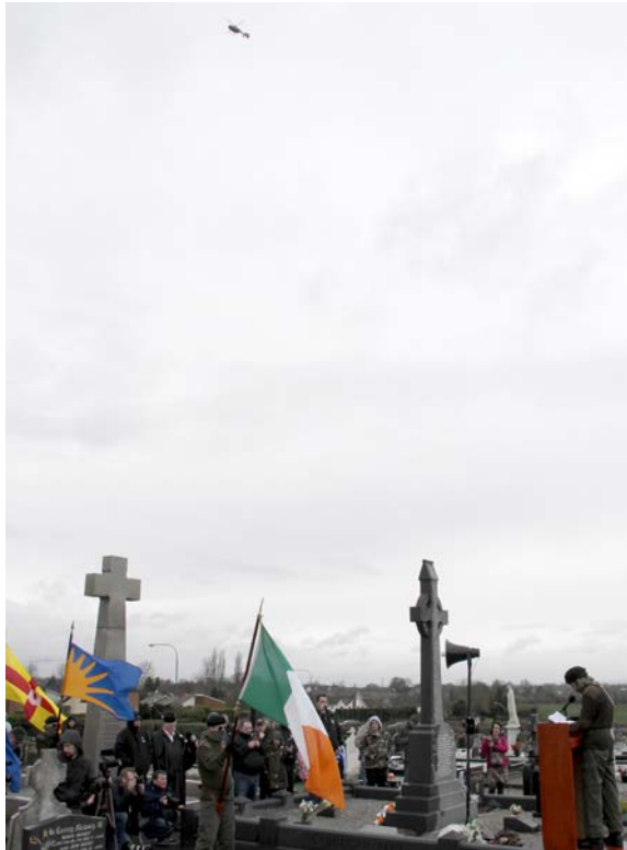
2 - A member of the colour guard reads the “Easter Statement” while a helicopter hovers overhead (26 March 2016)

In Image 2, a member of the colour guard addresses the crowd while the helicopter hovers overhead. The helicopter is relatively high above the cemetery and it appears that its presence was a minor inconvenience. However, at times the helicopter would fly at a lower level, perhaps to allow for better photography and/or video recording by the authorities, and this would make it difficult to hear speakers. Also, as I moved about the cemetery trying to photograph the speaker and the helicopter in one image, it seemed that the helicopter would intentionally change location. Filming, instead of photographing the speaker and the helicopter, would probably have provided a better record of the event.