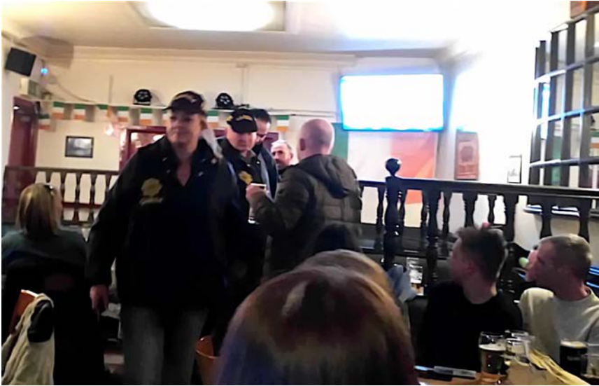
8 - Members of the Special Branch walk through a group of Republican Sinn Féin supporters in a Dublin pub (taken with a cell phone; 23 April 2016)