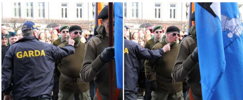
7 - A member of the Garda Special Branch pulls the scarf from the face of a member of the republican colour guard (28 March 2016)

After the group took their positions in front of a podium from which speakers would address a sizeable crowd, Special Branch officers walked into the formation and pulled the scarves down. Image 7 presents two photographs combined into one image. It was a petty and provocative display of the ability of state agents to interfere with an event. If someone had resisted, s/he would have been arrested. And even if the charges were eventually dropped, it might be after a year or more of entanglement in the legal system.