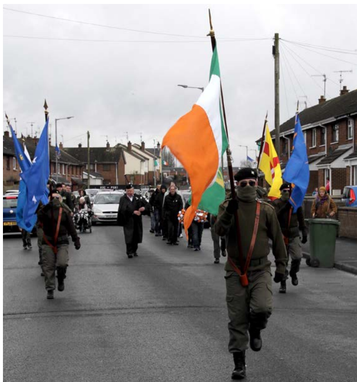
1 - Republican colour guard, Kilwilkie Estate, Lurgan (26 March 2016)

Image 1 shows the colour guard – dressed in fatigues and wearing scarves and berets – marching through the Kilwilkie Estate. The fatigues and scarves are controversial and often draw the attention of the press, anti-Republican political figures, and the police (see McDonald 2016). Prior to the event, an unmarked police car drove through the area and passed by several people who participated. A helicopter appeared overhead.