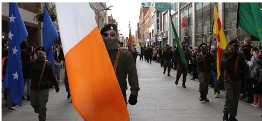
6 - A republican colour guard leads the “Easter Rising Centenary” march through central Dublin (28 March 2016)

When the march left the Garden of Remembrance, the colour guard had their scarves but they were not covering their faces. By the time they reached the GPO, they had paraded past thousands of people with their scarves covering their faces, as shown in Image 6.