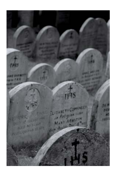
Figure 2 – Photo taken in the cemetery of the Convent of Nano Nagle in Cork.

ENC: Nano Nagle's convent seems to me a turning point in the history of Ireland and of Cork city. And I am fascinated by the seedy parts of the city after growing up in the College. The threat was because the nuns had been educated in France, Catholic education being forbidden in Ireland.