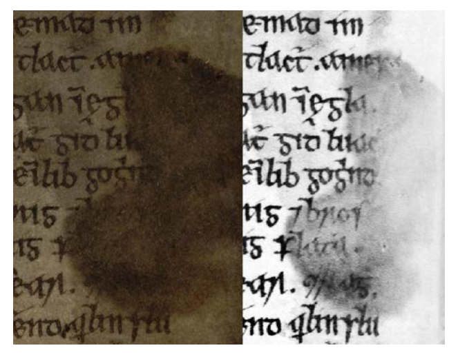
Figure 2 – RIA MS D ii 1(Book of Uí Mhaine,) f. 155v26-33, visible image, PCA

adbul // flaiteamnais marthomles tlacht. aines Treidi flatha refreagra. gan omon gan imeagla. agus oinmideacht. // gan leathbreath gid luach Treidhi airdrig luaiter lind. geilli nageimlib go grind. alíth. tath tuath agus sith coigrích. // brig agus bros Coma agus comdluth catha. treidhi gac urríg flatha. cudh isblad. iscosnam eirgach aenfear. // agh. Treidi rondaire iarnuair. airem coitchend ar lin slu