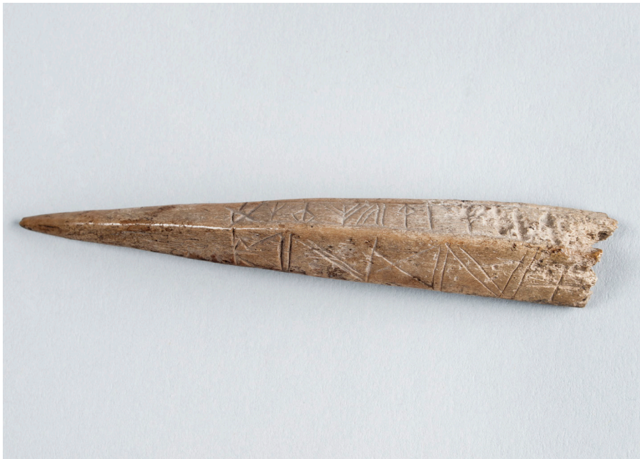
Fig. 3 – The Wijnaldum A antler horn, Fries Museum, Leeuwarden – Collection Koninklijk Fries

A number of inscriptions show links with Scandinavian runic features, suggesting that around the 9 th century the Frisian runic system may have been affected by a significant influence of the Norse tradition, perhaps as a consequence of the Viking presence in the Frisian territory (Looijenga 2003, 328). The piece of antler Wijnaldum A (fig. 3), of uncertain date and preserved in the Fries Museum in Leeuwarden, looks like a small three-sided horn. On two sides the object is engraved, on one side with ornamental signs such as crosses, squares and triangles; the other side exhibits a quite cryptic runic inscription, for which the transliteration “z ng zz uu ng i zz ng” has been proposed, to be interpreted, reading from right to left, as (I) ng(u)z , Inguz , (I)ng(u)z , maybe a triple invocation of the eponymous god of the Ingaevones (Sipma 1969, 69-70). Beyond the exegetical difficulties of the runic sequence, the object is of some interest because it presents significant analogies with the Lindholm amulet, coming from the region of Skåne (Sweden) (fig. 4). Not only the shape of the Wijnaldum A bone fragment is close to that of the Swedish amulet, but also the anomalous form of some runic signs, which have been traced with double lines.