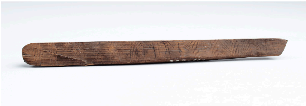
Fig. 6 – Britsum yew-wooden stick, Fries Museum, Leeuwarden – Collection Koninklijk Fries Genootschap