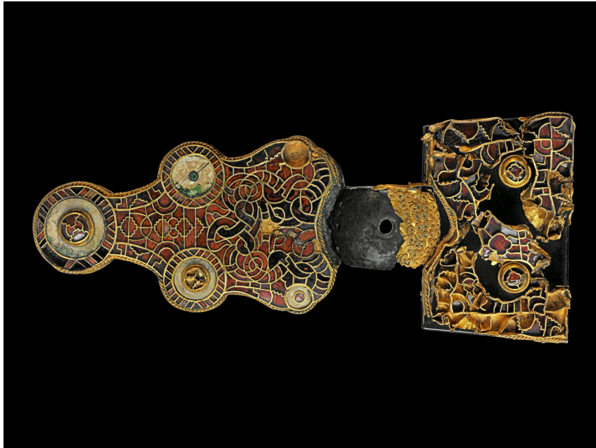
Fig. 1 – The Wijnaldum brooch, ca. 625, Fries Museum, Leeuwarden – Collection Province of Fryslân