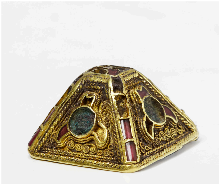
Fig. 2 – The pyramidal sword stud from Ezinge. Collection Groninger Museum: Photo Marten de Leeuw