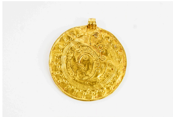
Fig. 8 – Hitsum bracteate, Fries Museum, Leeuwarden – Collection Koninklijk Fries Genootschap

Fōzō might be a North Gmc female personal name ( \bar{o} -stem), or else it could allude to the tribal name of the Fosii. The form groba could be Old Saxon or Old Frisian and may be compared with ON gróf and OHG gruoba “groove, furrow”, possibly meaning “belonging to a grave”. According to Seebold (1996, 196), the Hitsum bracteate might be connected with a funeral rite.