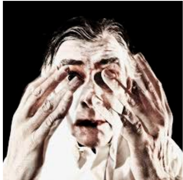
Figure 4 – 5. From: The Mohs scale , 2012. Digital pigmented print on Arches paper 640g/m2. 96 cm x 96 cm.

true as regards the objects called to participate in this game: clues perpetually alluding without ever unveiling. This is also why Molder has always rejected the notion of his work having a narrative character 31 .