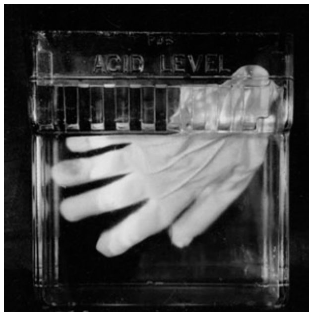
Figure 3. From: The secret agent , 1991. Gelatine Silver Print. 102 cm x 102 cm.

ance, where there is nothing to tell, despite it having all the necessary conditions for awakening a sense of deciphering. They are sets of suspended situations” (Molder [2006b]: 233).