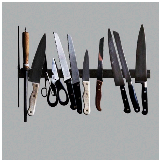
Figure 2. From: Call for papers , 2012. Digital pigmented print on Arches paper 640g/m2. 96 cm x 96 cm (courtesy of the artist).