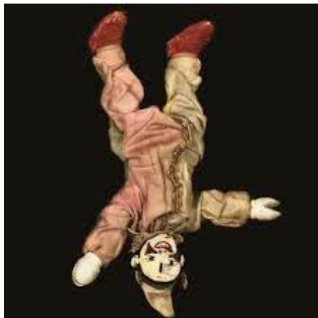
Figure 10 – 11. From: The Mohs scale , 2012. Digital pigmented print on Arches paper 640g/m2. 96 cm x 96 cm (courtesy of the artist).

The body subjected to the forces of these peculiar stages, as we have said, is that of a character that ‘is’ and ‘is not’ Jorge Molder. Following on from what we suggested above, such a self-representation may also be described in terms of self-deformation. The series A escala de Mohs [ The Mohs scale ] (2012), whose title refers to the scale the German mineralogist Friedrich Mohs created in 1812 to describe mineral hardness, seems to confront the issue of our bodies’ resistance to the action—to the inscrutable game—of Time . The progressive emergence of this character reveals a figure of man as a puppet in the hands of time, “mask man or marionette placed on the magma of time” 48 , as Merleau-Ponty writes in his Notes de cours at the Collège de France 49 in a poignant section dedicated to Claude Simon. In this same series, a puppet resonates with Molder’s double body, as a double of a double.