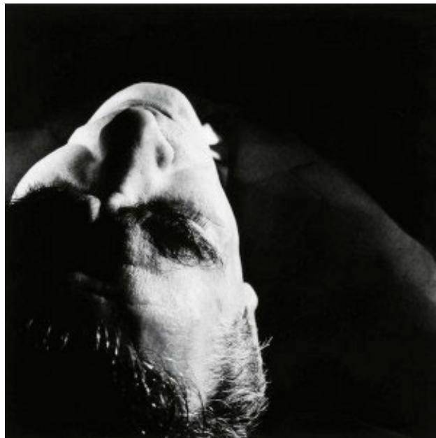
Figure 8 – 9. From: Anatomy & Boxing , 1997. Gelatine Silver Print. 102 cm x 102 cm.

creating a sort of relationship between the “constructor of images” ‘Jorge Molder’ and the double produced by the series in question. The latter can explicitly question the former, can observe ‘him’, creating another kind of doubleness involving both text and images 42 .