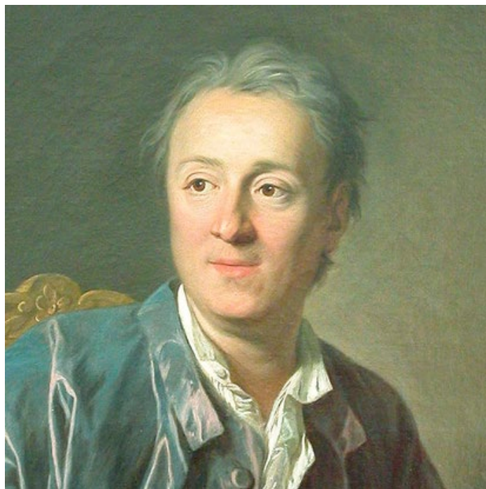
Figure 2. Louis-Michel Van Loo, Portrait de Denis Diderot (1767)

occurs to Diderot the moment he finds himself before a portrait of himself by Louis-Michel Van Loo [Figure 2]. Despite the wealth of “moments of resemblance” marking this portrait as one of well-known philosophe , and despite the painting title ( M. Diderot ) unquestionably reflecting his own identity , the philosopher seems unable to recognize himself in this image. When describing Van Loo's portrait in his compte rendu for the Correspondance littéraire , he writes as follows: