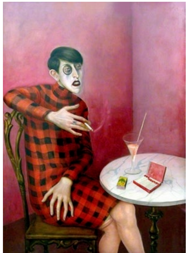
Figure 5. Otto Dix, Portrait of the Journalist Sylvia von Harden (1926)