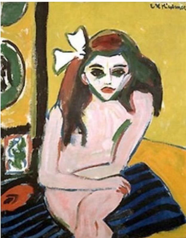
Figure 4. Ernst Ludwig Kirchner, Marzella (1909-1910)