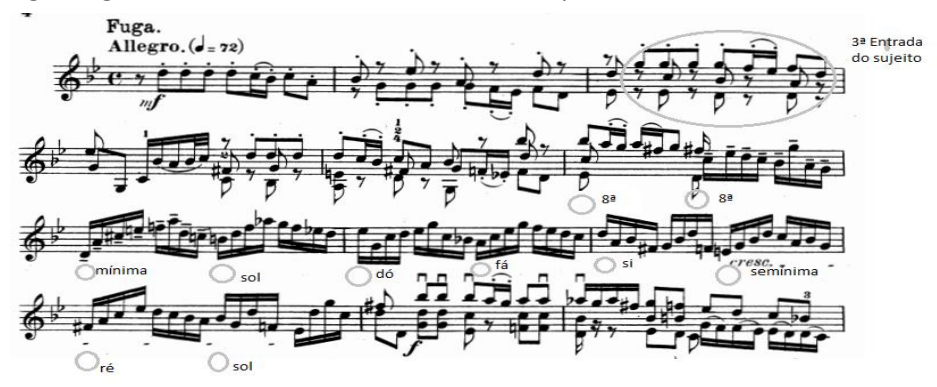
Fig. 1 - Excerpt of the Fuque under examination, in its violin version, BWV 1001b

The beginning of the violin score illustrates some aspects of what was said: