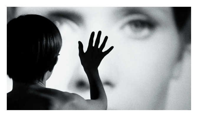
Figure 3: I. Bergman, Persona, 1966.

In order to recognize an iconographic exemplum that reveals haptic etymological polysemy in the pandemic scenario, a cinematic sequence frequently mentioned (Gallese [2015]: 209-2013; Barker [2009]: 28-29), paradigmatic for the detachment between disembodied touching and affection, results in the prologue of Persona (1966) by Ingmar Bergman (Figure 3). In the roughness of black and white, what the moving images vividly render coincides with the phenomenon of