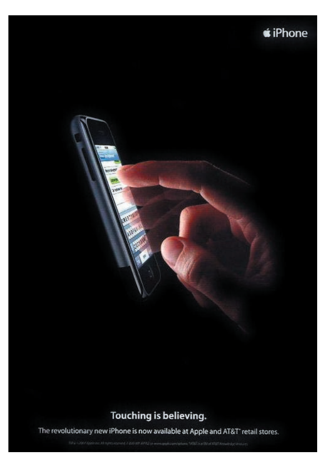
Figure 8: iPhone Apple advertisement, Touching is believing, 2007.

Here, a hiatus opens up concerning the surreptitiously «vulva-like» dynamism with which the finger of Thomas, the incredulous apostle, penetrates the plague on Christ's ribs (Most [2005]: 164): the blasphemous euphoria to brush and being brushed by the heavenly body culminates in the satisfaction of a digital desire. At that time, the hand, à la Deleuze, «is reduced to a finger» ([1981]: 104) or to a supervising pupil. Nevertheless, breaking the space of distance — the