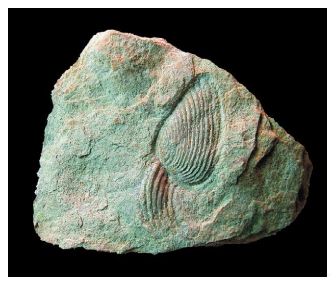
Figure 2: Aptico Monte Subasio, Courtesy Gruppo Umbro Mineralogico Paleontologico.

cal variant, entered the lexicon of aesthetics and visual culture through the German studies of applied psychology of the late nineteenth century (Grunwald [2008]: 15-39), it seems appropriate to underline how the "haptic movement" includes affective-emotional elements related to the variant of the etymology haptō, in the biblical meaning of lighting and burning. It is in the wake of this suggestion that the motility of the haptic, as Giuliana Bruno said, com-moves, generating an emotional movement (Bruno [2002]: 6; [2014]: 19) grounded on «entropathy», the visceral resonance into the joints of the Other body (Nancy [2003]: 11, trad.) (Figure 1). However, a second and eccentric meaning of the term haptic exists and is pertinent to palaeontology. At this juncture, hap-