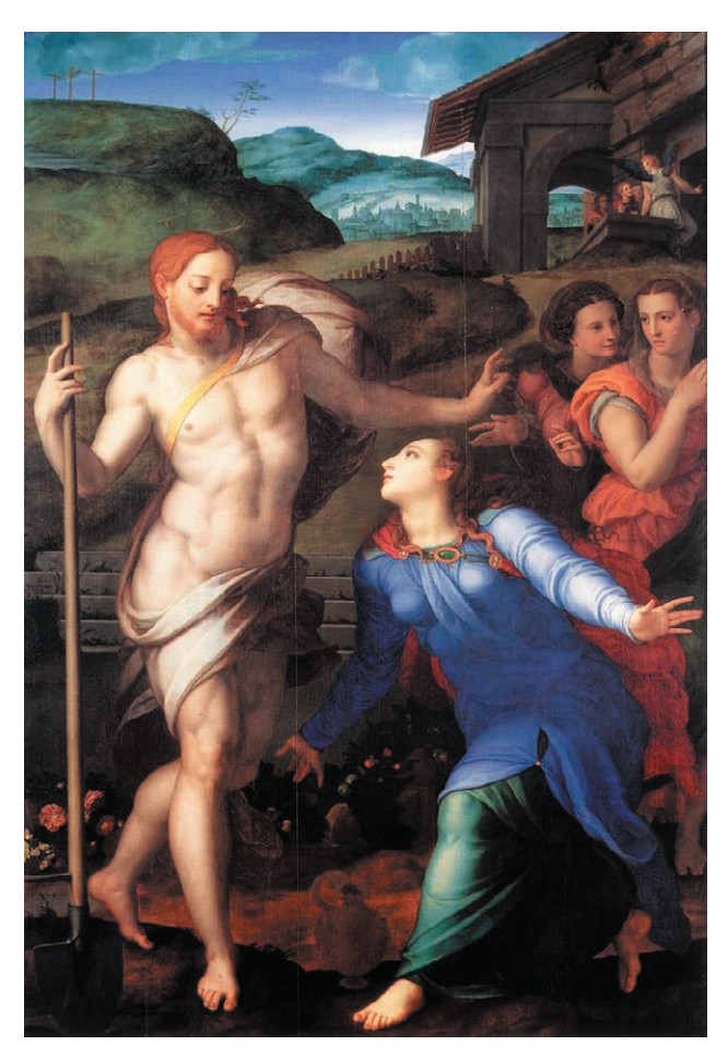
Figure 7: Agnolo Bronzino, Noli Me Tangere , 1561. Oil on poplar wood, 291 x 195 cm. Paris, Museo del Louvre.

Between the Paragone delle Arti and the Greenbergian media specificity, the junction at which this excess finally overcoming the ideological impasse of a téchne regarded as degrading is located in the last quarter of the eighteenth century. As pointed out by Elio Franzini, Herder's merit was to have systematized the relationship between touch and sculpture on the heels of previous treatises, which from Condillac to Burke recognized in touch a subordinate sense endowed with an analytically obscure quality (Franzini [2013]: 185, trad.). However, it is striking to note how Herder, who recognized sight as a sense dependent on touching — «We believe we see something when in fact we touch it and where only touch is appropriate» (Herder [1778]: 38) — already supposes what Andrea Pinotti has emblematically called «a Herderian uncertainty» (Pinotti [2009]: 181, trad.). A symptom of this aesthetic short-circuit that disorients the German philosopher's system, based