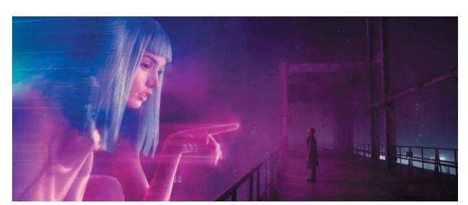
Figure 4: Frame from Blade Runner 2049 by D. Villeneuve, 2017.