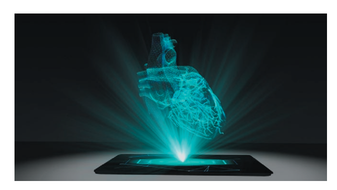
Figure 10: Hologram prototype generated by Ikin's RYZ.