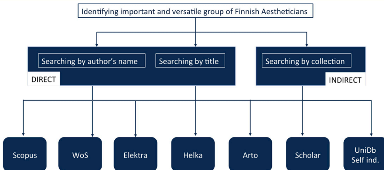
Figure 1: The process of searching indexed publications