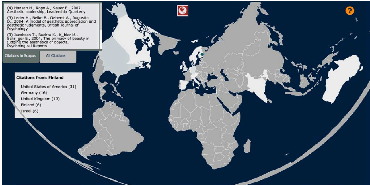
Figure 2: Most cited countries by Aestheticians from Finland based on Scopus data. Dynamic version of the map can be seen here http://dhoa.aalto.fi/citemap/ 1

Based on this we can make an assumption that some researchers started to publish in indexed journals recently. However, only 3 out of 6 selected researchers have any of the publications in these databases.